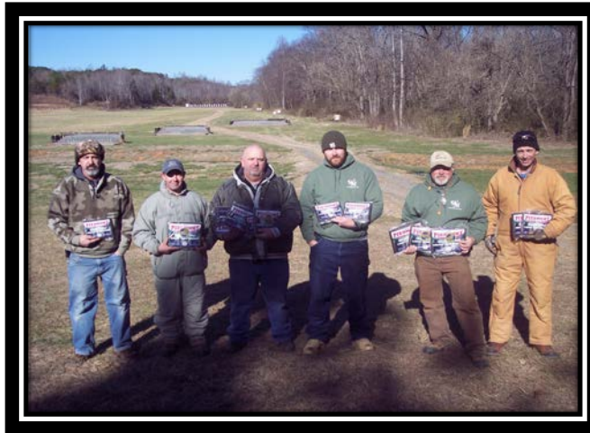
JANUARY 6, 2018 PIEDMONT GUN CLUB WINNERS