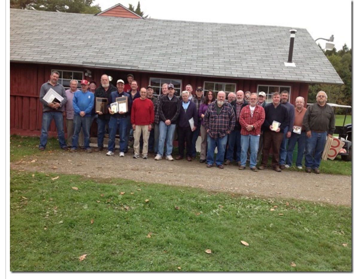
Group shot of the Shooters.